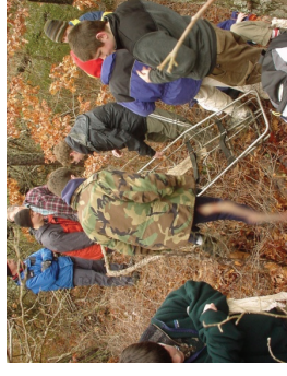
Search and Rescue Activities

Boy Scout Troop 503 enhances values key to the development of academic, leadership, and citizenship skills, as well as fostering self-confidence and ethics, traits that influence Scouts' future adult lives. For over 100 years, Scouting programs have instilled in youth the values found in the Scout Oath and Scout Law. Today, these values are just as relevant in helping youth grow to their full potential as they were in 1910.