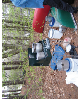
Cooking on the Ipswich River