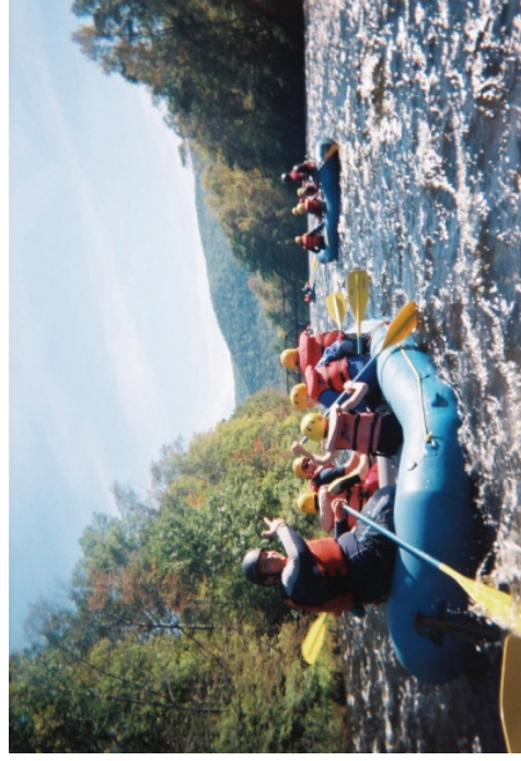
Deerfield River Rafting

Highlights from previous year's trips include hiking, biking, rafting on the Deerfield River, Red Sox Scout Day, kayaking, canoeing, search and rescue exercises, FEMA demonstrations (the dogs are amazing), tubing, skiing, snowshoeing, winter cabin camping, and cooking. During the past summers Boy Scout Troop 503 backpacked in Yosemite National Park in California and Yellowstone in Wyoming, and canoed the Allagash Wilderness Waterway in Maine.